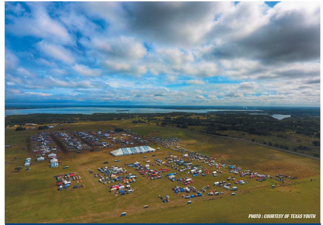
Hundreds and hundreds of Pathfinders campout on the grassy field at Lake Whitney Ranch.