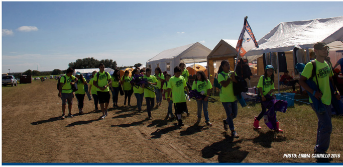
The Spring Tomball Pioneer Pathfinders carrying their chairs for thursday afternoon service.