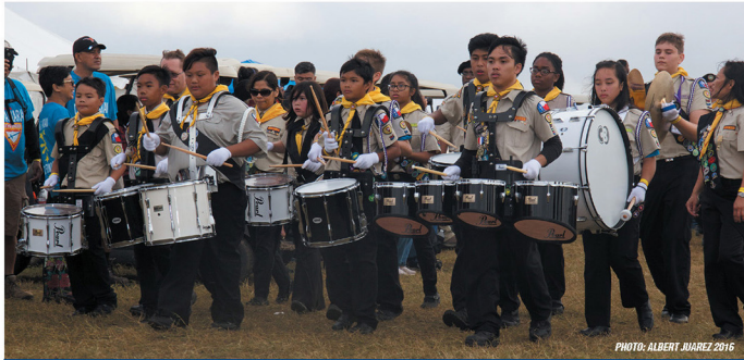
Drum corps from the Texas Conference started the parade at union camporee on Sabbath morning.