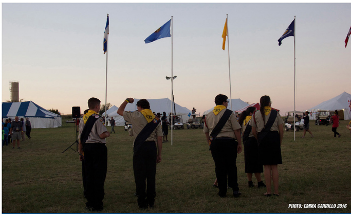
Pathfinders getting ready to receive the Sabbath after the flag ceremony on Friday evening.